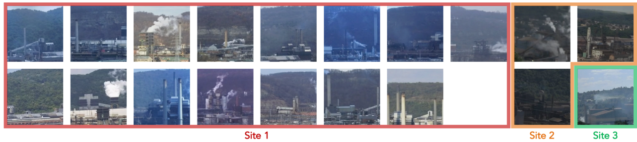
Figure 2: All views of videos in the RISE dataset. The rightmost four views are from different sites pointing at another facility.