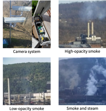
Figure 1: Dataset samples and the deployed camera system.

https://www.epa.gov/emc/method-9-visual-opacity