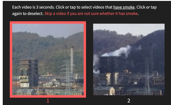
Figure 3: The individual mode of the smoke labeling system. Users can scroll the page and click or tap on the video clips to indicate that the video has smoke with a red border-box.