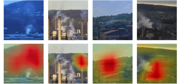
Figure 5: True positives in the test set from split S_0 . The top and bottom rows show the original video frame and the overlying heatmap of Class Activation Mapping, respectively.

Class Activation Mapping (Selvaraju et al. 2017). It uses the gradients that flow into the last convolutional layer to generate a heatmap, highlighting areas that affect the prediction. Ideally, our model should focus on smoke emissions instead of other objects in the background (e.g., stacks or facilities). Figure 5 shows true positives (sampled from 36 frames) for smoke and co-existence of both smoke and steam.